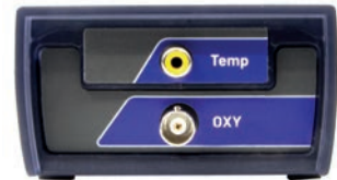
Connections on OXY 7 Vio

XS OXY 70 Vio model uses an optical sensor , available in two versions: cable length 2 m or 10 m .