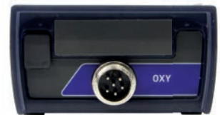
Connections on OXY 70 Vio