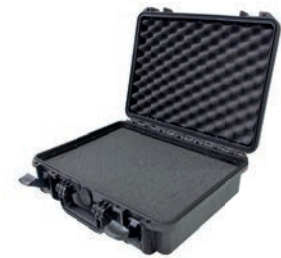
IP 67 case - optional cod. 50010972