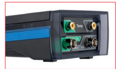
The semi-transparent plastic body protects the connectors