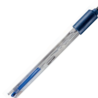
201 T DHS

Digital pH electrode with DHS technology. Temperature sensor integrated. Plastic body for general use. Maintenance free.. pH: 0...14 - T: 0...60 °C cod: 32200103