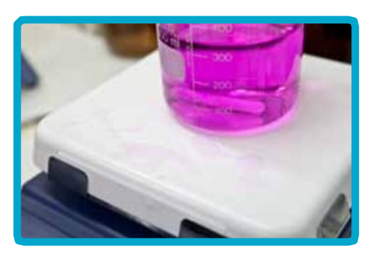
Glass ceramic hotplate with high chemical resistance