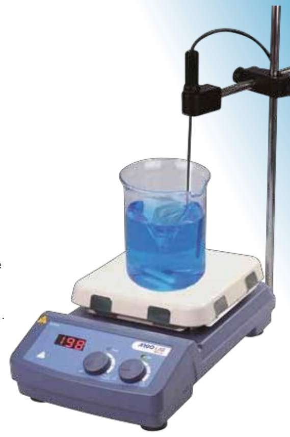
Stirrer M3-D with adjustable stand and PT 1000 probe