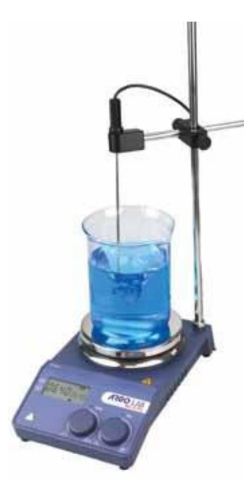
Stirrer M2-D Pro with adjustable stand and PT 1000 probe